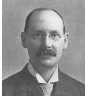
Dr. James Carroll