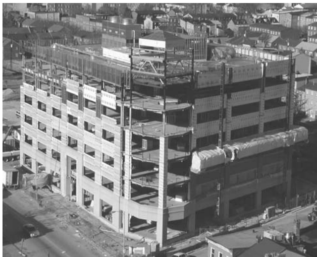
Building One of UMB BioPark nears completion.