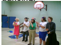
We enjoyed the opera!