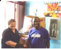
We gave away Books!