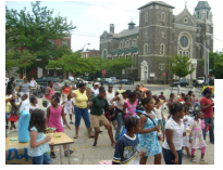
We had fun!

Just a look back at some exciting things that we did last year. Let the pictures speak for themselves!