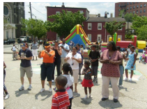
We did line dancing!