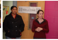
We had interns!