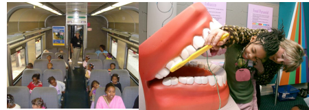
We went on trips!