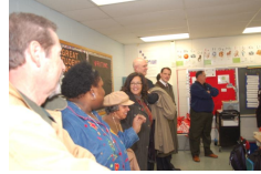
We hosted visitors!