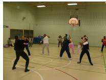
We got fit!