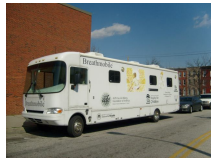
We received services!