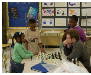
We played chess!