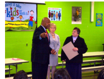
We were awarded!