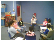
We held groups!