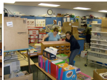
We had volunteers!