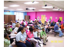
We had workshops!